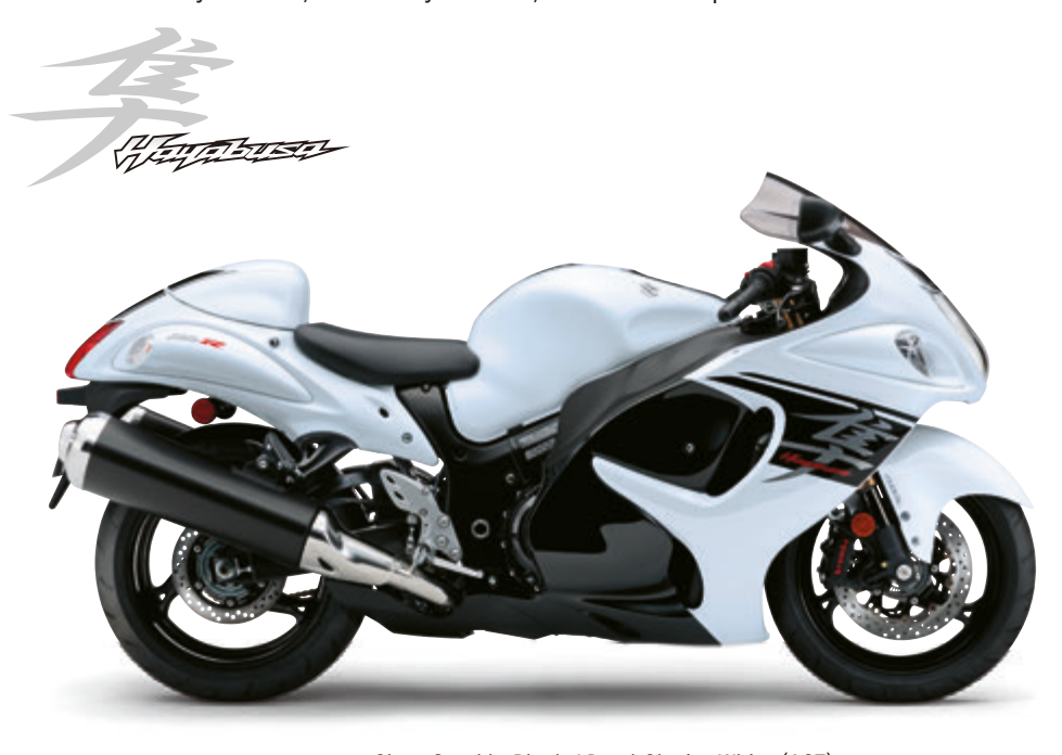
Glass Sparkle Black / Pearl Glacier White (AGT)

Over the last decade, the motorcycle has evolved while staying true to its concept – the pinnacle of high-performance motorcycles. Its sensational power, speed, smooth ride and overwhelming presence continue to fascinate owners and onlookers alike. Because the Hayabusa is, and always will be, the ultimate sport bike.