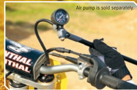
Air pump is sold separately.