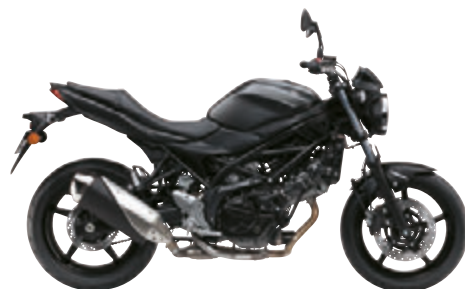
Metallic Mat Black No.2 (YKV)