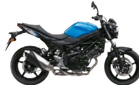
Metallic Triton Blue (YSF)