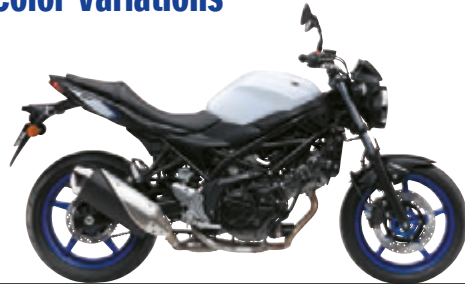
Pearl Glacier White (YWW)