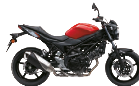
Pearl Mira Red (YVZ)