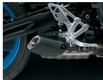
Short Muffler Design

system is optimized to provide a solid, satisfying click with each shift you make.