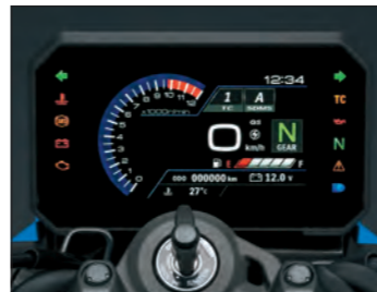
Color TFT Multi-information Display