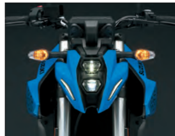
LED Headlights and Position Lights

The standard-equipment Bi-directional Quick Shift System lets you shift up or down without operating the clutch lever. Shifting is smooth and sure, and the