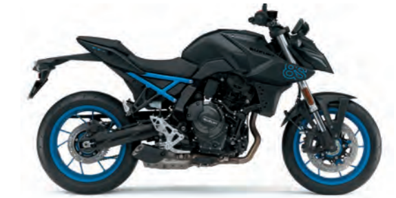
Metallic Mat Black No.2 (YKV)