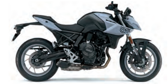
Glass Mat Mechanical Gray (QT7)