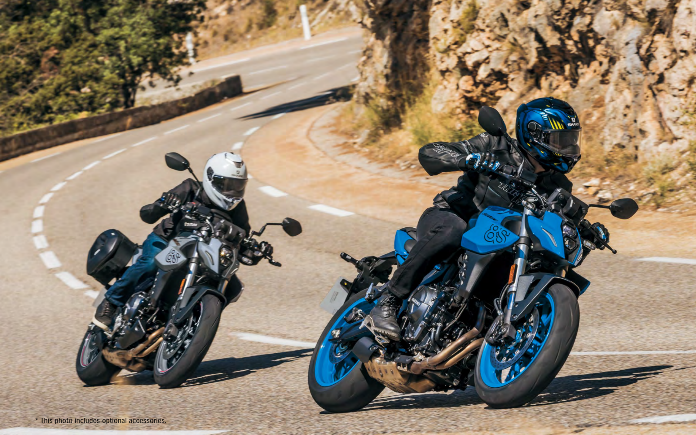
* This photo includes optional accessories.

The ergonomic handlebar switch layout maximizes operating ease and efficiency so you can intuitively access all controls while focusing on the road ahead. Select modes and make settings and adjustments for each S.I.R.S. control system by simply operating the MODE and UP/DOWN switches on the left handlebar.