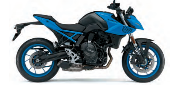
Pearl Cosmic Blue (QU1)