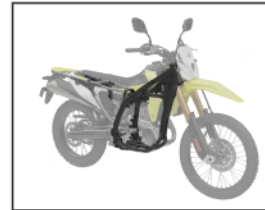
New twin-spar frame plus aluminium subframe