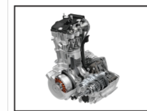
398cm 3 Four-stroke Liquid-cooled DOHC Engine