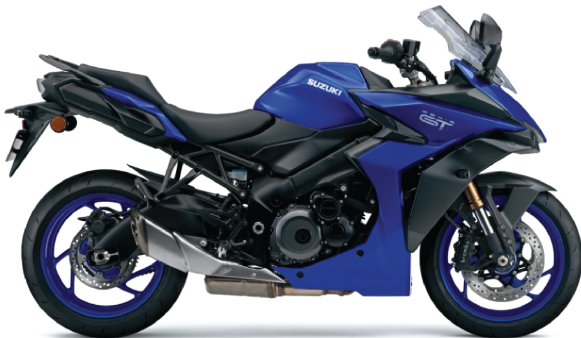
Colour: Pearl Vigor Blue (YKY)