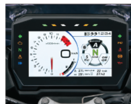
6.5-inch Full-color TFT Display